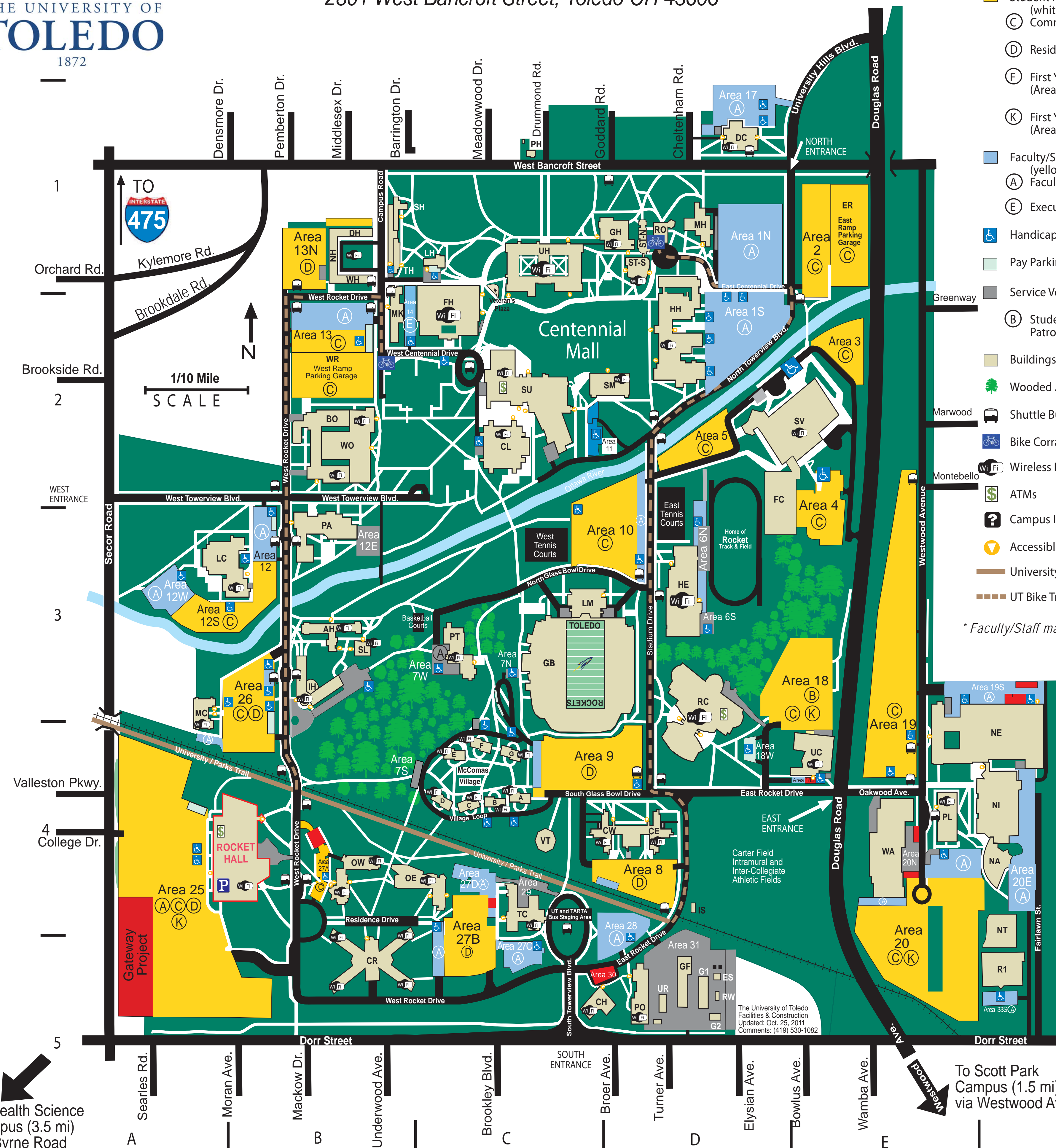
Map showing locations of UT's Main, Scott Park, and Health Science Campuses

*Health Science Campus **Scott Park Campus